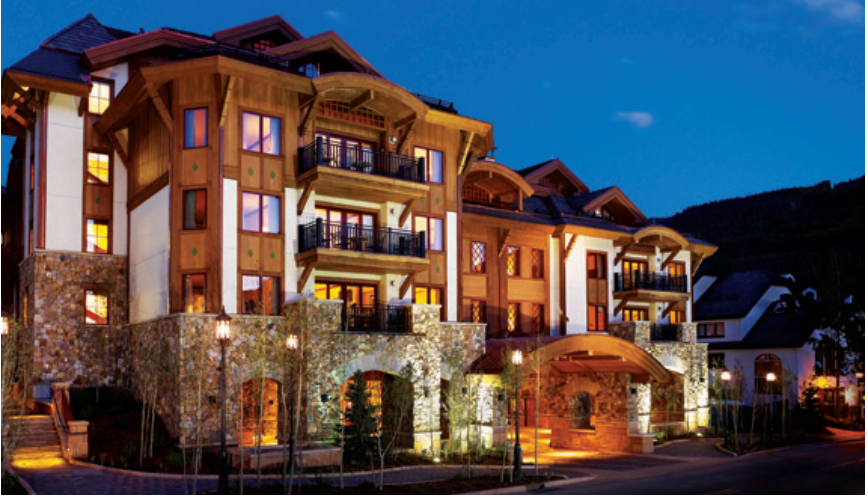
The Sebastian - Vail, A Timbers Resorts Hotel & Residence Club